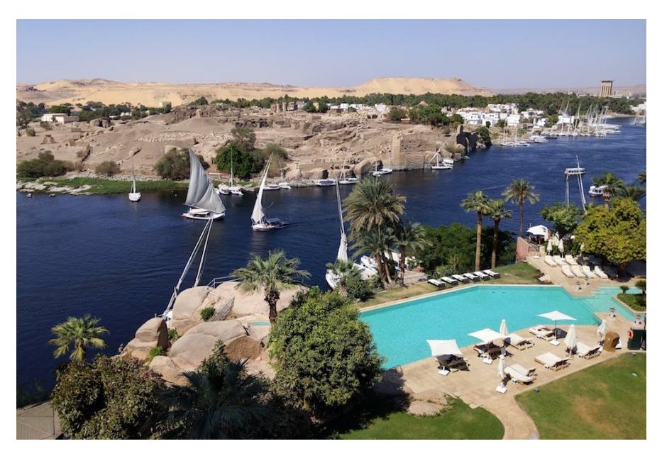
My balcony view from The Old Cataract Hotel in Aswan.

Egypt is on most people's bucket list, and with good reason: 5,000 year-old feats of engineering genius, fascinating historical drama, rich traditions and culture. While the pyramids and temples will still be around if you wait a few years to go, right now you can experience them in a rare and special way. I traveled in Egypt for two weeks at the end of October (you can see more of my photos <u>here</u> and <u>here</u>) and am so glad I did. Here's why it felt comfortable to me during Covid: